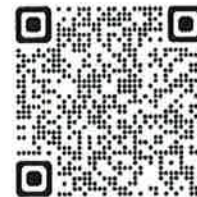
QR code for commissioner districts map

District #1 District #2 District #3 District #4 District #5